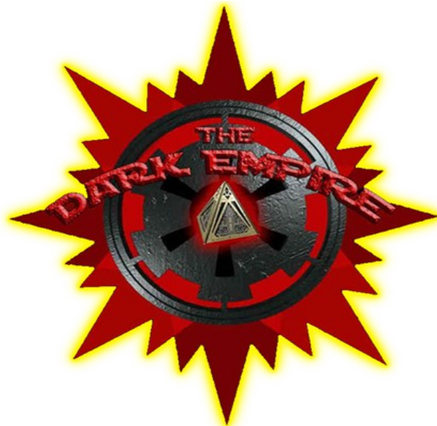
TDE "Classic logo"

The Dark Empire is an international Star Wars costuming organization comprised of Star Wars fans, and is not sponsored by Lucasfilm. However, The Dark Empire is recognized by Lucasfilm as a fan-operated organization. Star Wars, its characters, costumes, and all associated items are the intellectual property of Lucasfilm Ltd.